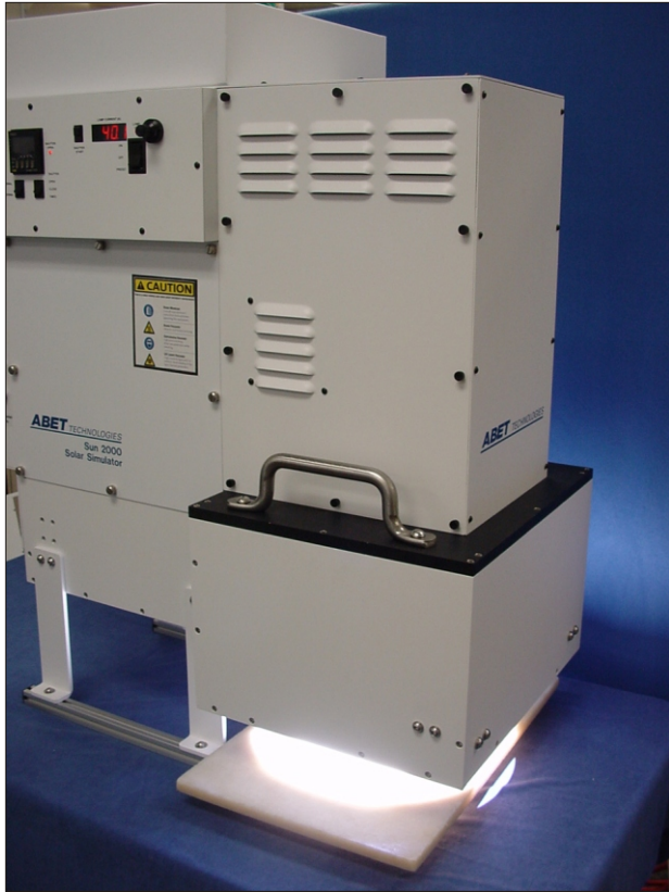
Abet Technologies Model 11044 A Sun 3000 210 x 210 mm Solar Simulator.