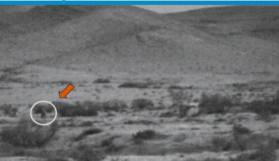
Person identification at >450m