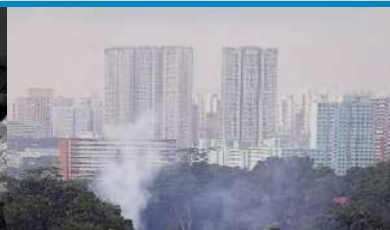
Vision enhancement: looking through haze with SWIR