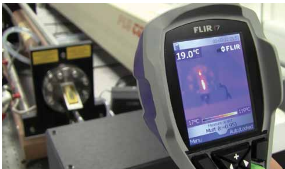
By visualizing the heat from invisible infrared laser beams the FLIR i7 helps to guarantee the researchers' safety.

according to Ma. "The terahertz region of the electromagnetic spectrum sits between the microwave and the mid infrared region, which is usually defined by the frequency range of 0.1 – 10 THz. It is one of the least explored ranges of the electromagnetic spectrum, but it shows great potential for applications in the fields of science, security and medicine."