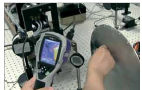
Using the FLIR i7 thermal imaging camera Ma aligns the optics in his research setup.